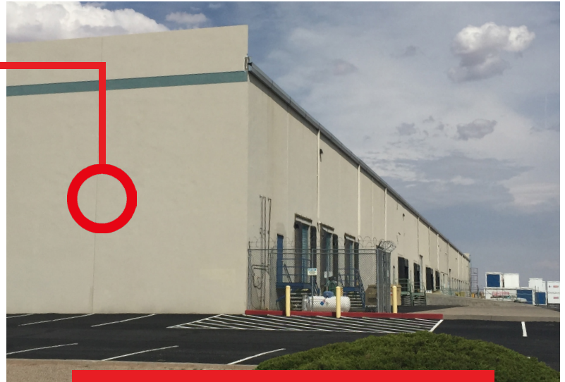
OVERSIZED 20' x 20' DRIVE-IN DOORS